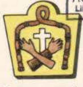
Franciscan Arms Early California Missions

Division of Maps AUG 31 1949 Library of Congress