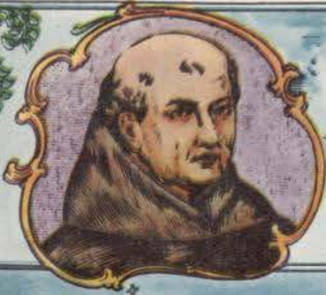
Padre Junipero Serra Founder of the California Missions